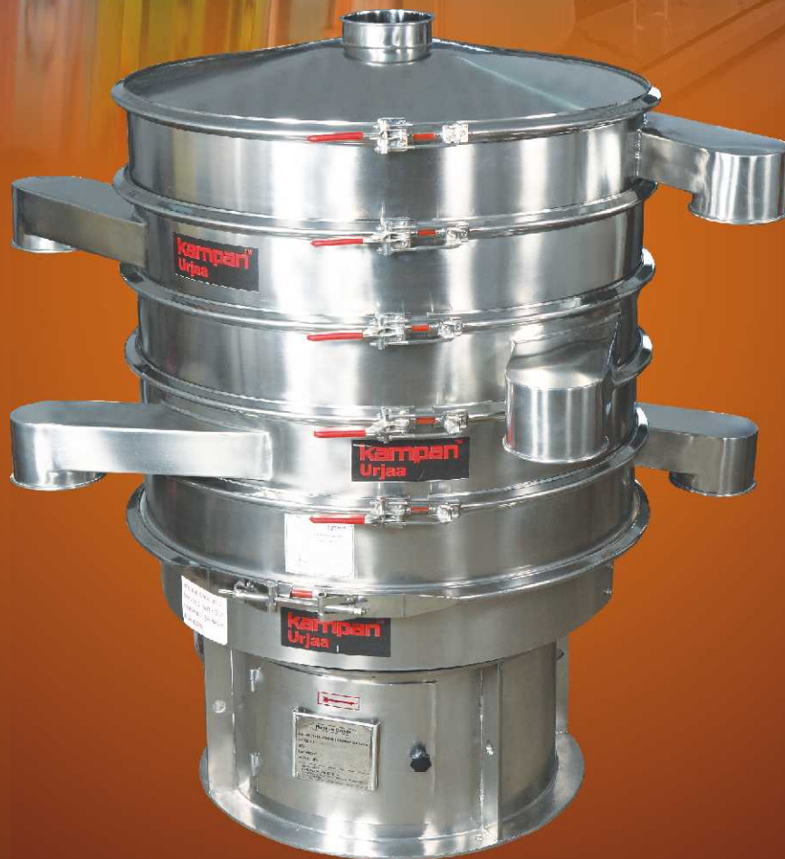
Circular Screen Separator